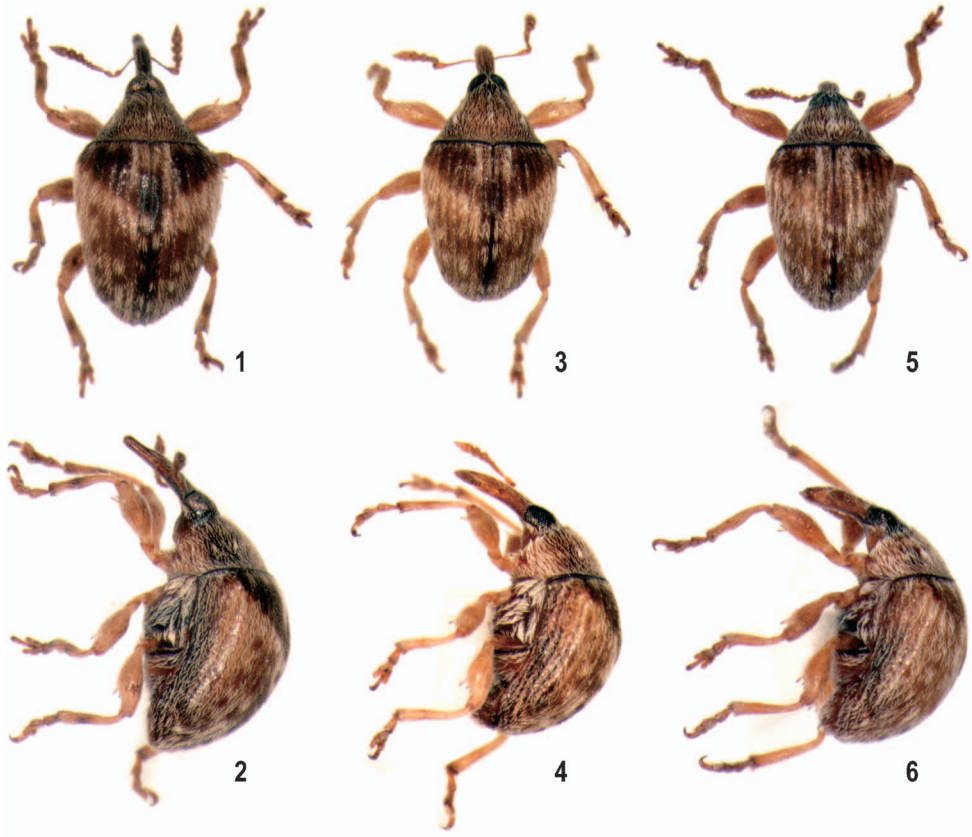
Figs. 1–6. Habitus photographs of Shiva taiwanus sp. nov. and Nanophyes formosensis KÔNO (1–4, Shiva taiwanus ; 5, 6, N. formosensis ). — 1, Female, dorsal view; 2, ditto, lateral view; 3, male (holotype), dorsal view; 4, ditto, lateral view; 5, male, dorsal view; 6, ditto, lateral view.

often fuscous along suture and lateral margin, with dark brown to fuscous basal triangular band and irregularly small patches behind middle; venter with meso- and metathoraces more or less darkened, ventrite sometimes darkened partly; legs pale brown except fuscous apices of tibiae, tarsi and denticles of femora, tibiae and femora each often with dark fascia. Vestiture of white to yellowish white elongate scales slightly condensed on base of 2nd elytral interval and sides of pro- to metathoraces and procoxae; elytra with fuscous hairs in dark areas. Specialized erect setae present on pronotum, odd intervals of elytra, femora and tibiae.